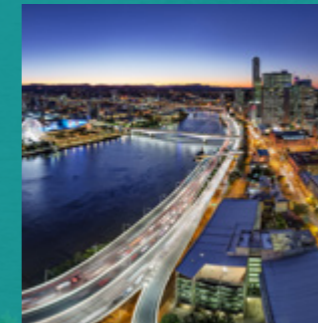
Third largest city in Australia with over 2.5 million people