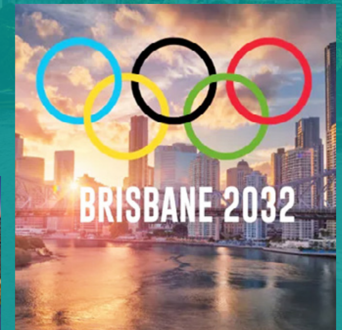
Brisbane will be home to the 2032 Olympic Games