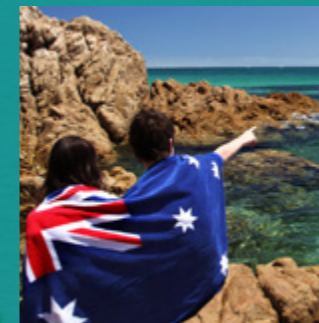
Queensland is known as the 'Sunshine State', with 283 days of sunshine per year