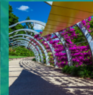
Wander around the Botanic Gardens, in-line skate or bike along the riverfront pathways, have a drink in a pub beer garden or catch a City Cat ferry and explore the Brisbane River