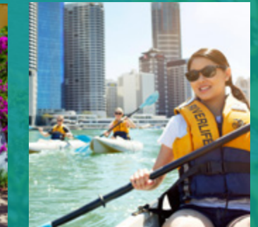
The Brisbane River winds through the city centre