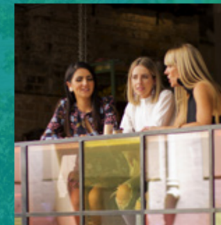
Eating and drinking in Brisbane is all about open-air experiences. Many venues have large windows opening onto leafy streets with tables and chairs spilling onto the sidewalks