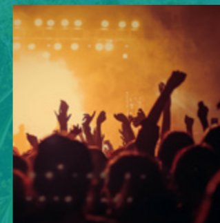
Queensland is a cultural hub with world-class galleries, museums, theatres, art-house cinemas, live music venues and events